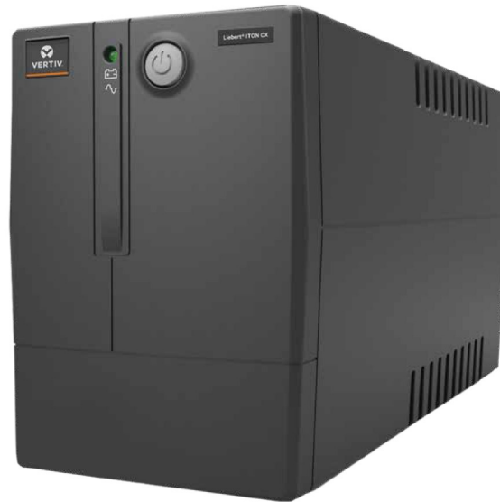
Liebert® ITON™ 600VA CX